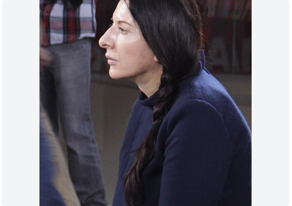
Marina Abramović at work, Museum of Modern Art, 2010.

Marina Abramović's impact on the art world is undeniable, with her groundbreaking performances continuing to inspire and provoke audiences worldwide. Her fearless exploration of physical and emotional boundaries has influenced a generation of artists, pushing the limits of what art can communicate.